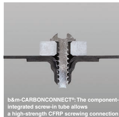
b&m-CARBONCONNECT®: The component-integrated screw-in tube allows a high-strength CFRP screwing connection