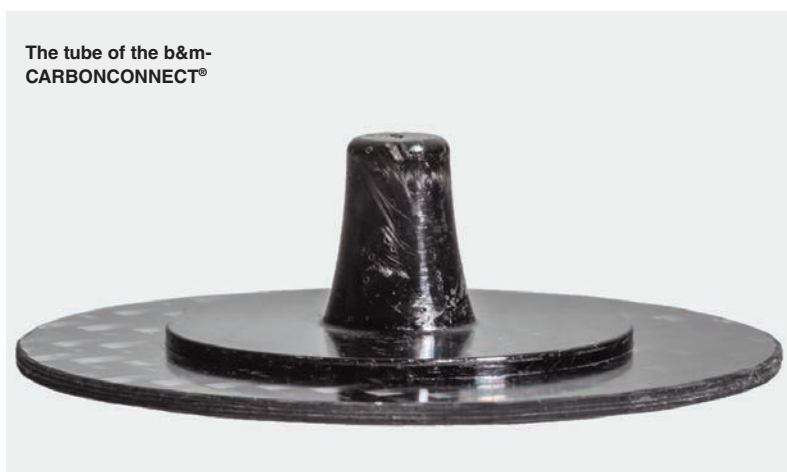
The tube of the b&m-CARBONCONNECT®