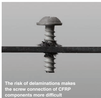
The risk of delaminations makes the screw connection of CFRP components more difficult