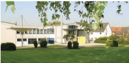
Group headquarters in an idyllic location in Ober-Ramstadt near Frankfurt.